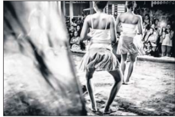
One of the photos in "Statia Song."

Bos wanted to catch the essence of their traditional life and document how they